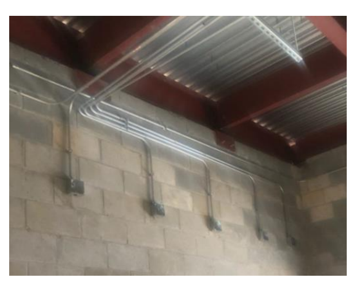
Figure 2 S. Atl – Electrical Rough-In