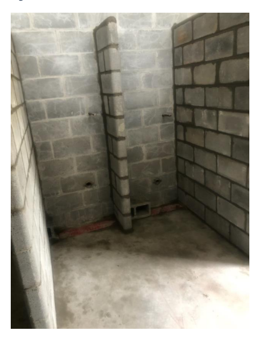
Figure 3 Carver – CMU toilet partitions complete